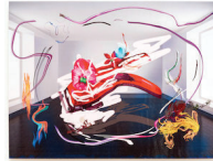
Ella Goerner room shave, 2016 UV print on pine wood, 80 x 60 x 3 cm