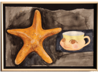
Andrew Munks smile and a starfish, 2016, Watercolour and gouache on paper, 30 x 25 cm