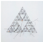
Tanaz Modabber baubotanik:unit, 2013 twigs, glue, 45 x 45 x 5cm