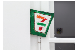
Keith Allyn Spencer Little Buy Little, 2014 greasy oily oil sticks, still-life cotton bed sheet, thin sheets of wood laminated together aka plywood, staples, 5" tall