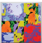
Michael Pybus Glitch Painting (Panel 1), 2016 UV Blacklight glow paint, acrylic and permanent pigmented ink on canvas 100 x 100cm