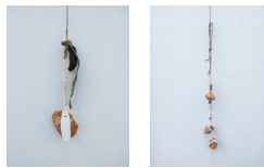
Martin Kohout Less a category, more a parameter, 2016, dried mushrooms, plums and herbs, twine, tooth picks (5 works total) 10 x 5 cm + variable twine