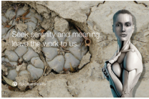
Lou Cantor Spiritual Reality, 2016, 6min video with sound (on iPad Mini)