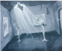
Paul Sochacki Aesthetics and Ecology, 2010 Acrylic on canvas, 160 x 130 cm