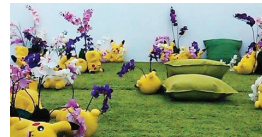
Michael Pybus In 3D the basil never wilts, 2014 Pikachu soft toys, IKEA HAMPEN green rugs, IKEA GURLI green cushion covers, IKEA VIGDIS green cushion covers, IKEA INNER cushion pads, IKEA FEJKA artificial potted orchids, SMYKA artificial orchid stems, 600 x 260 x 70 cm